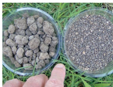
Super & Medium Size